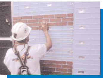
The Insulock thin-brick system, which uses STYROFOAM brand Tongue & Groove insulation, was installed on 50,000 square feet of surface area.

A crew of 12 installed 50,000 square feet of Insulock panels in a 16-week period, demonstrating the system's fast rate of installation. "The speed of installation is very fast," said Francis. "Other features worth noting are the panel's