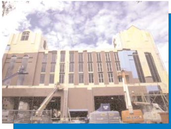
The $150-million Greektown Casino will feature 2,400 slots, 90 table games and 75,000 square feet of gaming space.

In 1996, Michigan voters approved three casinos for Detroit. One is Greektown Casino, a $150-million, Mediterranean-theme casino, complete with 2,400 slots, 90 table games, 75,000 square feet of gaming space and murals of the Greek Isles on the interior walls.