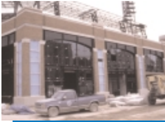
SHG Incorporated selected STYROFOAM brand insulation as the insulation material of choice for Comerica Park in Detroit.

When the team owner of the Detroit Tigers wanted to build a new ballpark, the Detroit office of SHG Incorporated was named as the architect of record. SHG designed a $260-million stadium with a seating capacity of 40,000 and selected STYROFOAM brand insulation as the insulation material of choice for the cavitywall and plaza deck constructions.